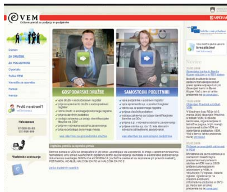
Picture 2. e-VEM portal screenshot

E-VEM is an example of good practice of e-administration, which considerably contributes to the reinstatement of an entrepreneur-friendly environment. It is a system with a design of interoperability and will enable operations also with foreign subjects. The system is also on the EU level one of the most advanced systems of public administration for companies. Such an advanced solution, which modernizes the functioning of the public administration and courts and is at the same time easy to use, can be reinstated only through good cooperation of all institutions and authorities, included in the project.